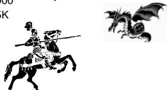
Jumping Angle Table

Use to find square roots involving mass, weight, or any value.